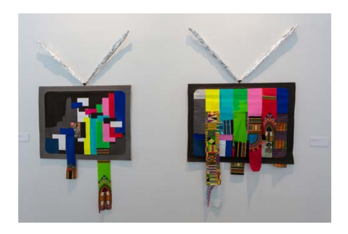
Derrick Adams Colorbar Constellation #3 and Colorbar Constellation #2 2016, acrylic, paper, fabric, pigment-printed canvas, 88" x 44" and 83" x 44".

Colorbar Constellations use the TV set as a recurring frame. Brightly printed strips of textile allude to the color bars used by video engineers in North America to calibrate analog recording or transmission signals. The same striped pattern (from left to right horizontal bands of white, yellow, cyan, green, magenta, red and blue) is painted on the walls of the gallery hosting On, which invites visitors to film themselves staring in fictional talk shows or infomercials livestreamed on the Museum's website. The dominance of celebrity culture and media worship seem to be readings of this work, but the term color bar also refers to social and legal systems in which people of different races are separated and not given the same rights and opportunities.