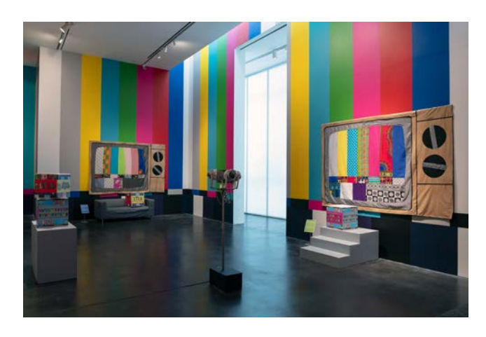
Derrick Adams On (installation view) 2018. Museum of Contemporary Art Denver.