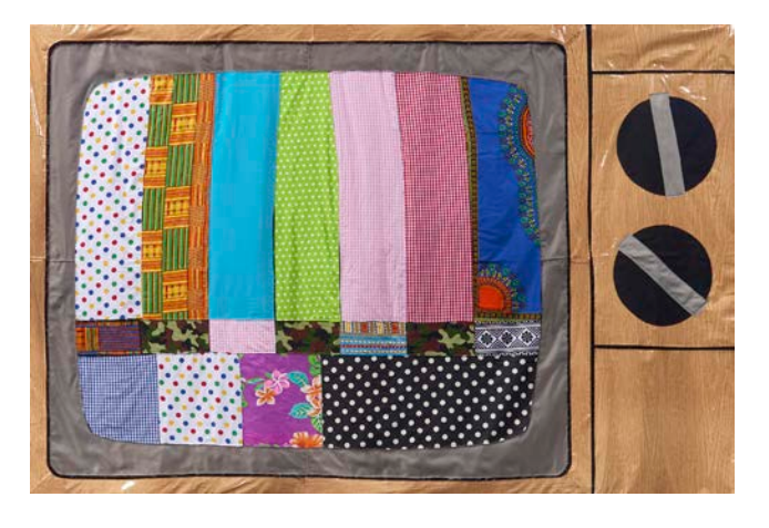
Derrick Adams Fabrication Station #4 2016, fabric collage, 48" x 108". Courtesy the artist and Vigo Gallery, London.